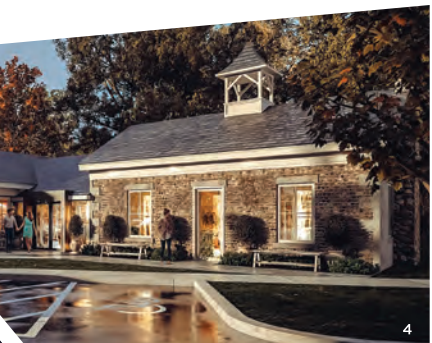
Phase 4 Retail - New York Beer Project 1 | Phase 4 Retail - Chase Bank 2 | Phase 1 Retail - Starbucks 3 | Phase 2 Retail 4