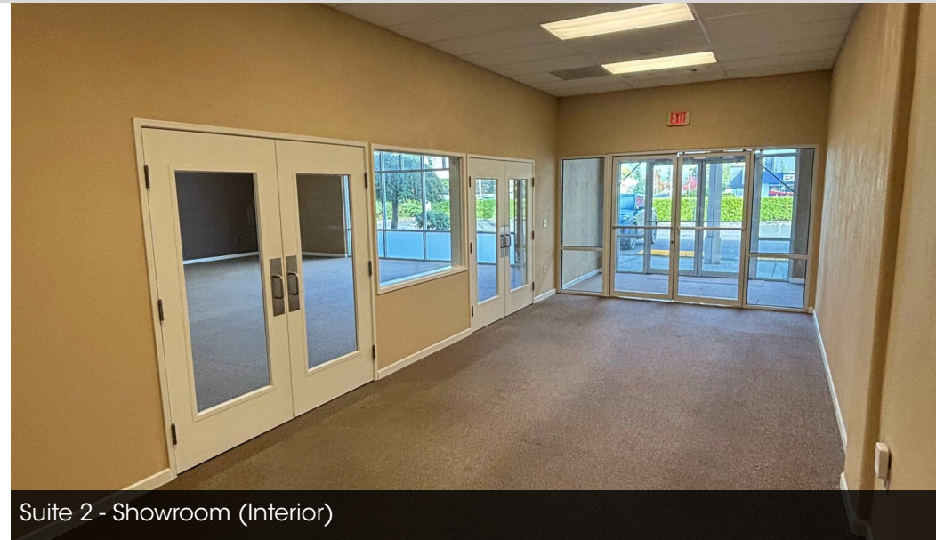
Suite 2 - Showroom (Interior)