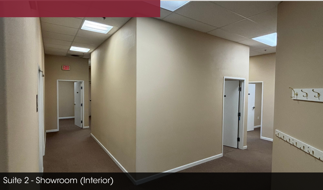
Suite 2 - Showroom (Interior)