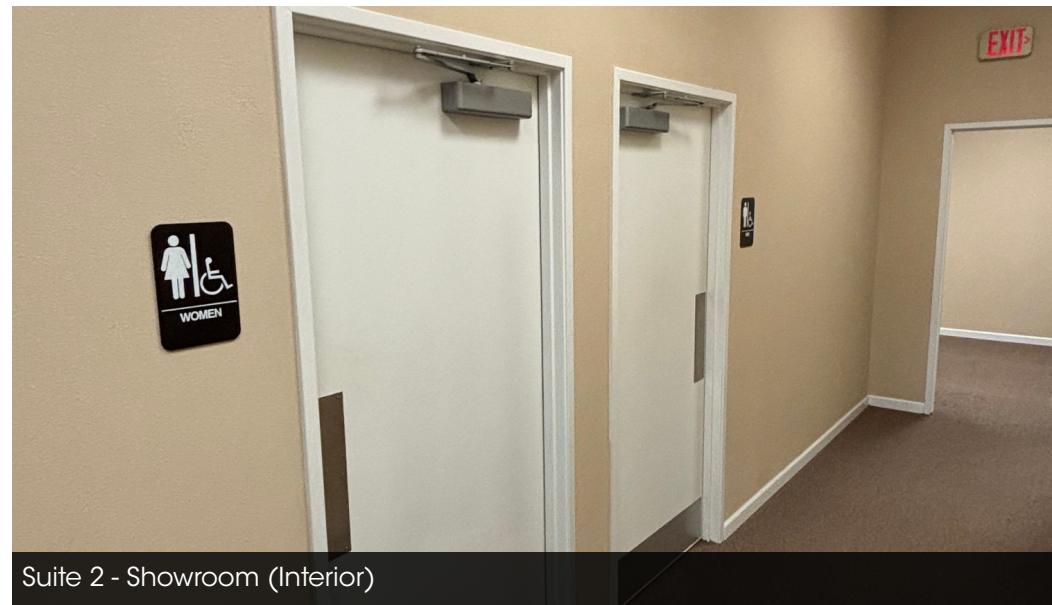
Suite 2 - Showroom (Interior)