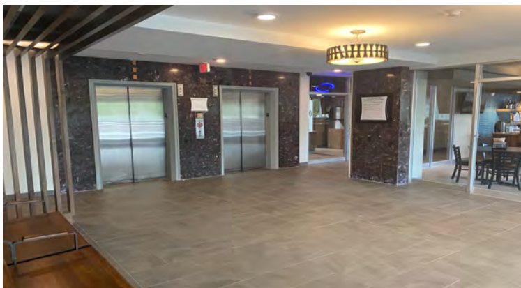
Photo of Shared Lobby