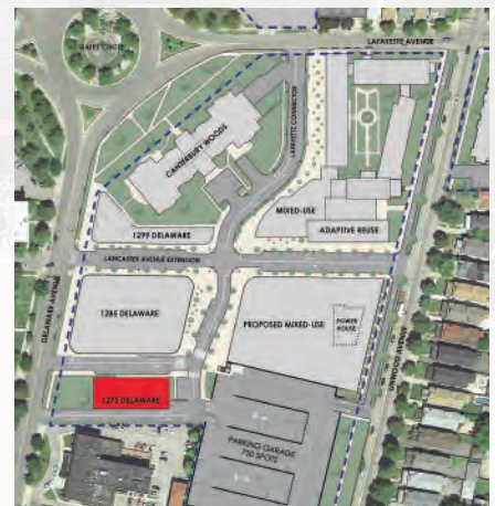
Lancaster Square Master Plan

TM Montante Development is transforming the former Millard Fillmore Gates Hospital into Lancaster Square; a vibrant, mixed-use, urban place featuring neighborhood retail, modern residential units, and commercial space.