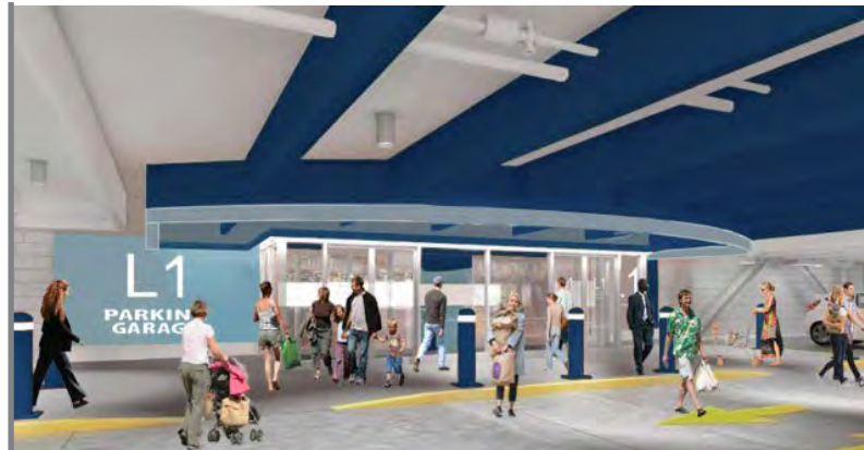
Rendering of Adjacent Parking Garage