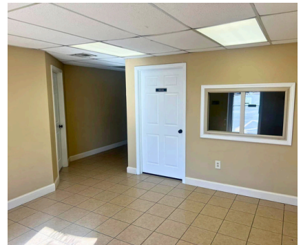
ENTRANCE TO OFFICE