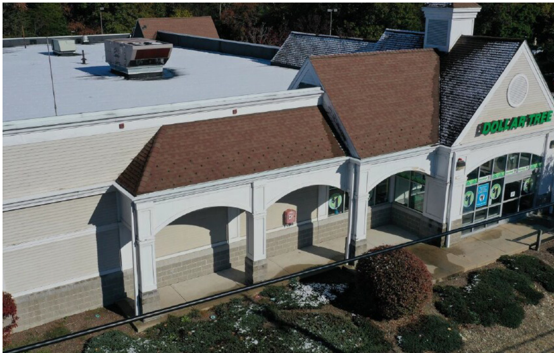
1914 Ocean Street, Marshfield, MA

12,124↑ Inventory Units 235↓ Under Construction Units 221↓ 12 Mo Absorption Units 6.4%↑ Vacancy Rate 4.9%↓ Market Cap Rate