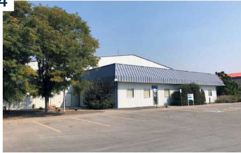
10705 FULTON STREET Brighton, CO 80601