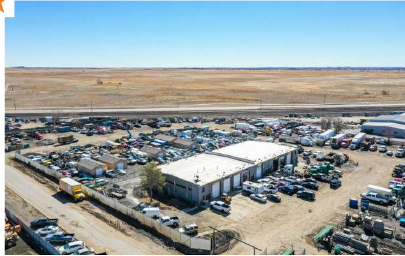
8470 E 86TH AVENUE Commerce City, CO 80022