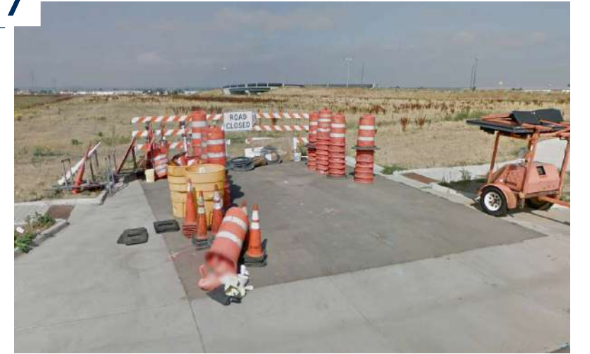
10399 HAVANA STREET Henderson, CO 80640