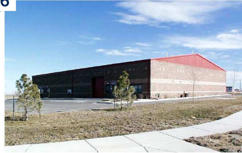
9752 E HANOVER COURT Henderson, CO 80640