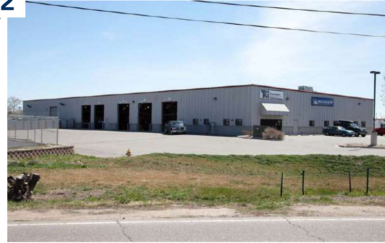
9156 BRIGHTON ROAD Henderson, CO 80640