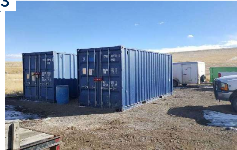
9180 BOSTON STREET Commerce City, CO 80022