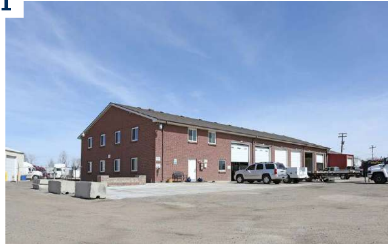
8331-8361 PONTIAC STREET Commerce City, CO 80022