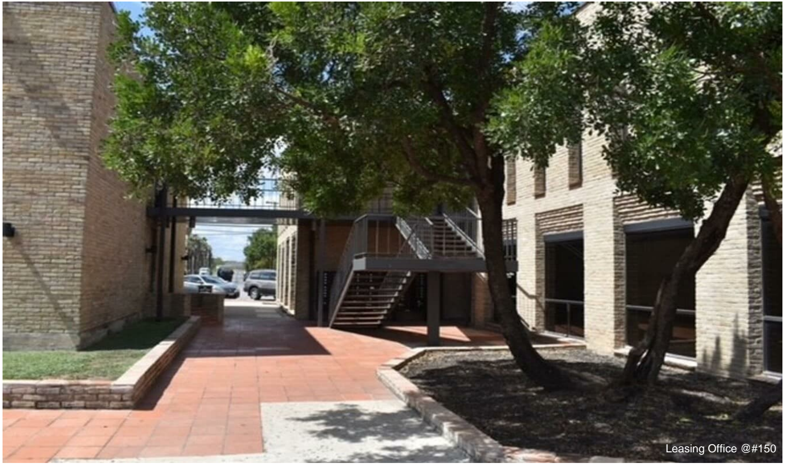
Leasing Office @#150