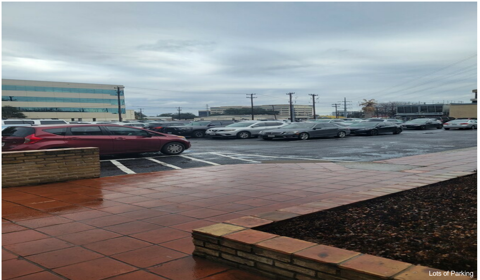
Lots of Parking