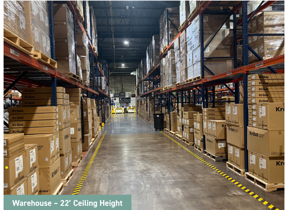
Warehouse – 22' Ceiling Height