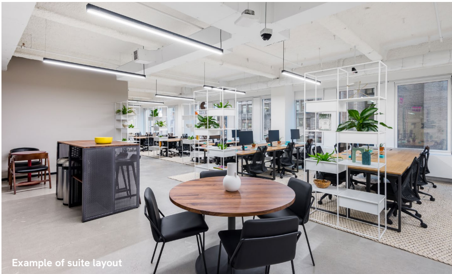
Example of suite layout