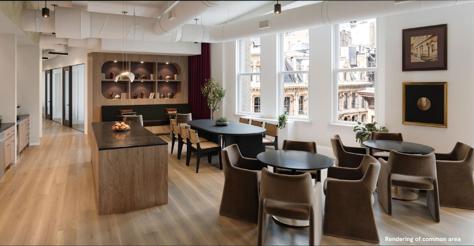
Rendering of common area