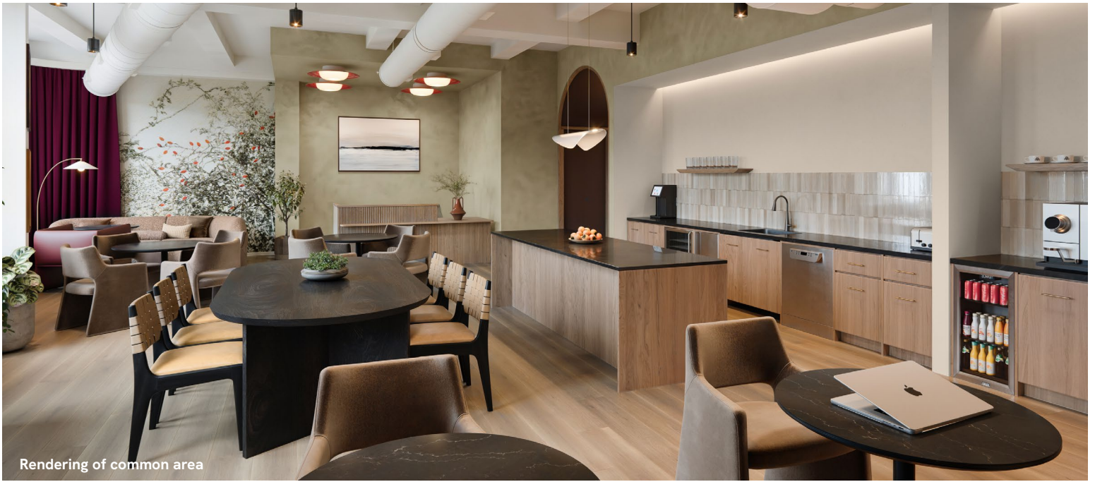
Rendering of common area