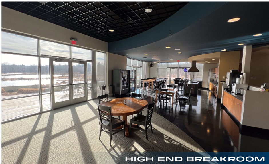
HIGH END BREAKROOM