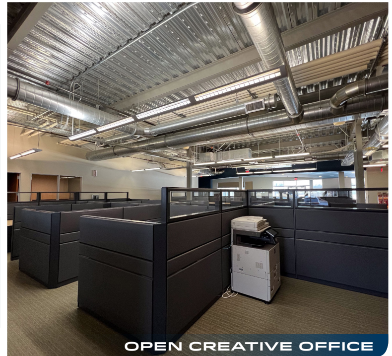
OPEN CREATIVE OFFICE