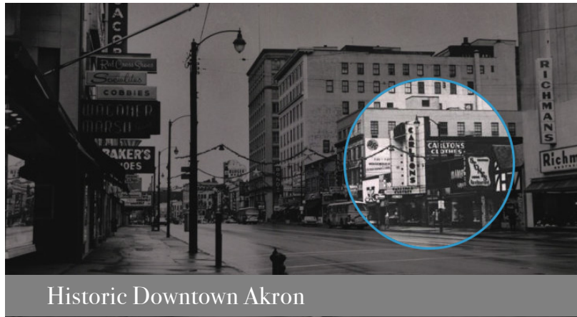
Historic Downtown Akron