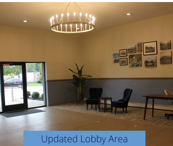
Updated Lobby Area