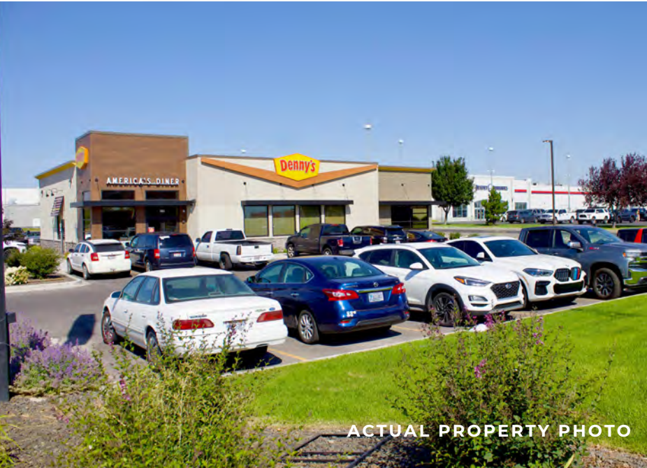
ACTUAL PROPERTY PHOTO