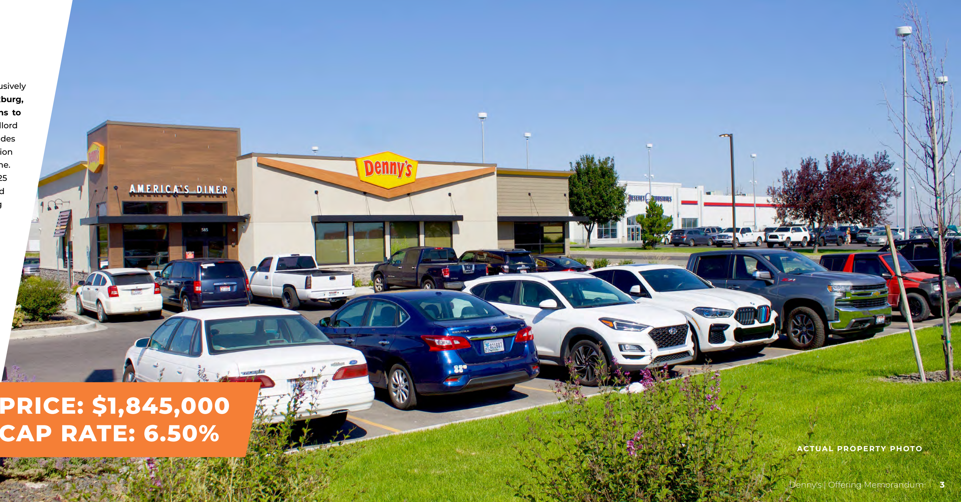
ACTUAL PROPERTY PHOTO