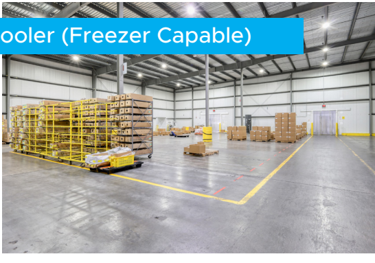
Cooler (Freezer Capable)