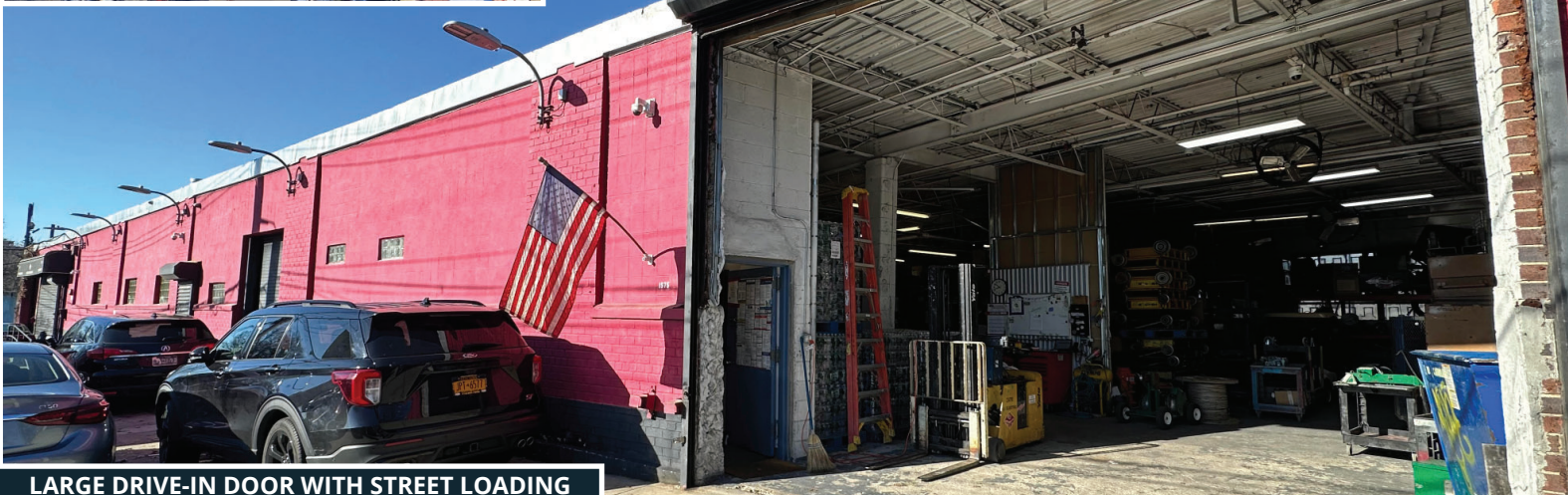
LARGE DRIVE-IN DOOR WITH STREET LOADING

DIRECT STREET LOADING TO BOTH FLOORS - IMMEDIATE POSSESSION!