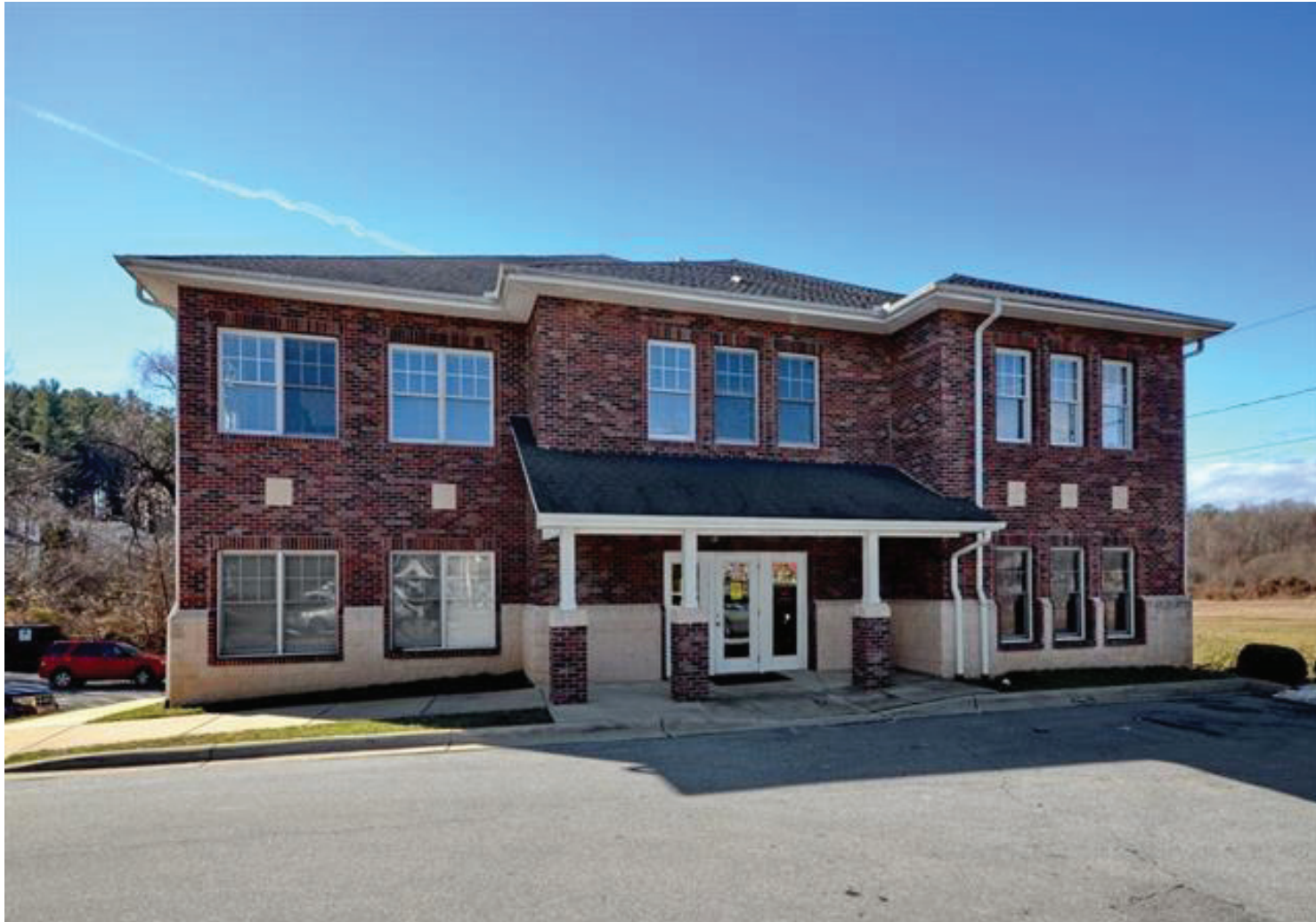
120 CHADWICK SQUARE CT - STE A, HENDERSONVILLE - FOR SALE | WHITNEY COMMERCIAL REAL ESTATE