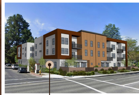
Conceptual Building Perspective