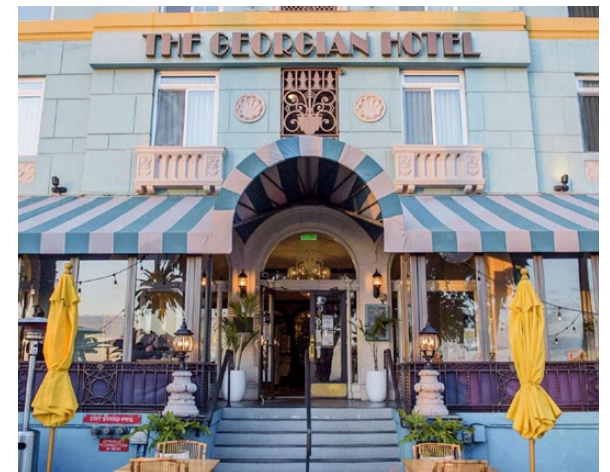
📍 THE GEORGIAN