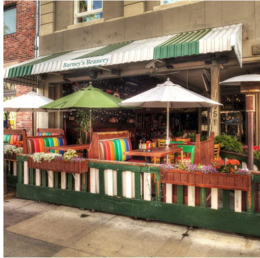
📍 BARNEYS BEANERY