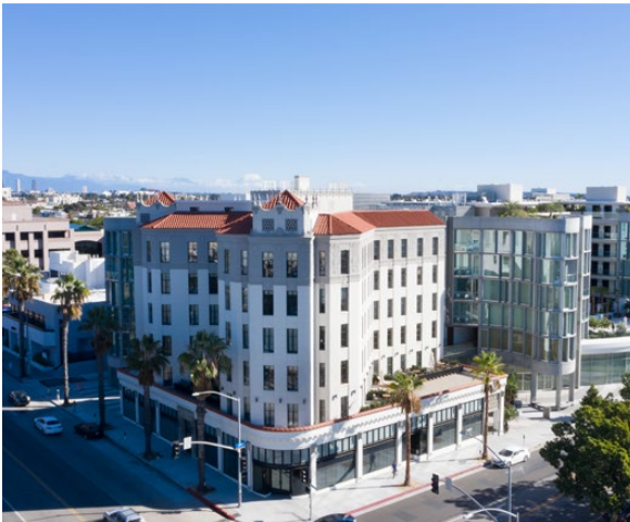
📍 THE PROPER HOTEL