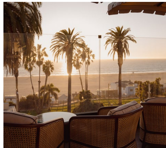
📍 SAN VICENTE BUNGALOWS