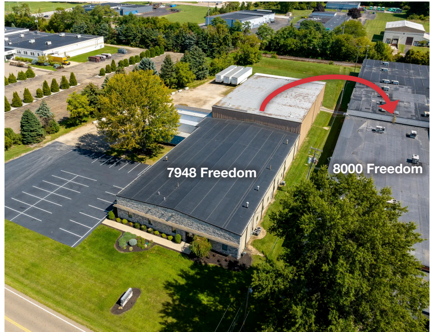
Expansion available in adjacent building.

*DIMENSIONS ARE APPROXIMATE. THIS INFORMATION IS FROM RELIABLE SOURCES BUT IS NOT GUARANTEED AND IS SUBJECT TO CHANGE