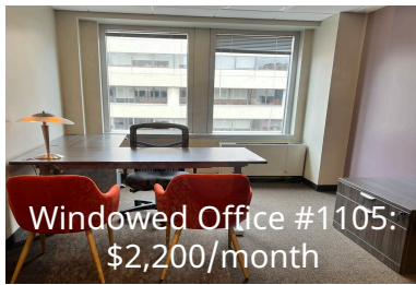
Windowed Office #1105: $2,200/month