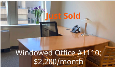
Just Sold Windowed Office #1110: $2,200/month