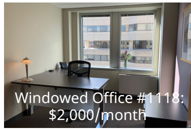
Windowed Office #1118: $2,000/month