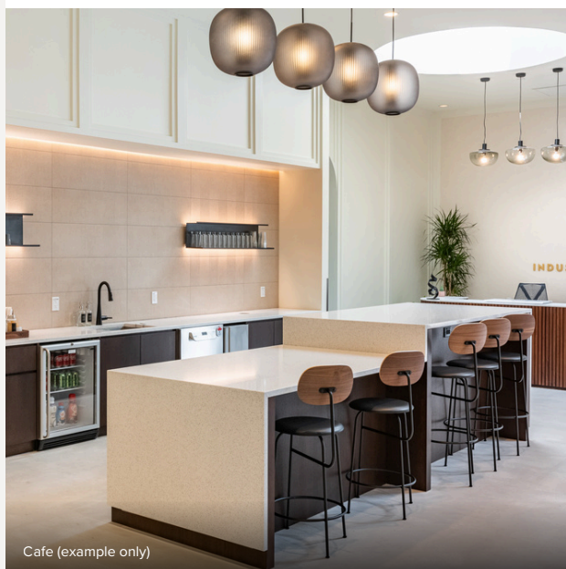
Cafe (example only)

Industrious is the highest rated workplace for customer satisfaction in the industry – offering premium coworking, private offices, and conference facilities with flexible terms and all-inclusive pricing.