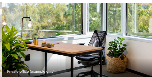
Private office (example only)