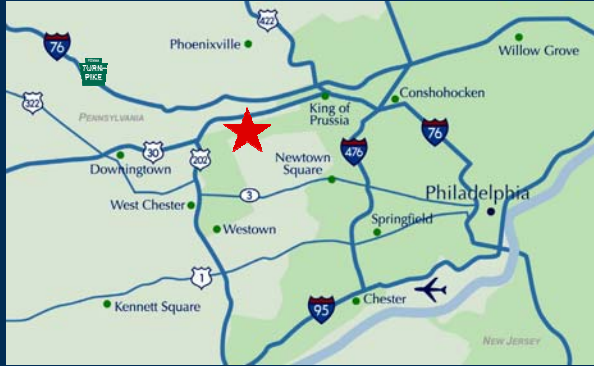
GEOGRAPHIC LOCATION MAP

Route 30 (Lancaster Avenue) & Route 29 (Morehall Road) East Whiteland Township, Chester County