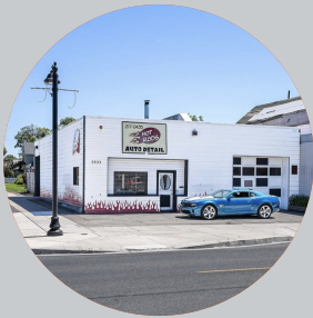
NEW ROOF TO BE COMPLETED PRIOR TO CLOSING