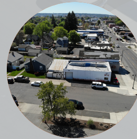
HIGH VISIBILITY CORNER LOT ON N MONROE