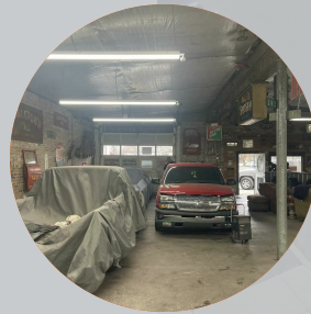
PROVEN AUTO DETAILING LOCATION