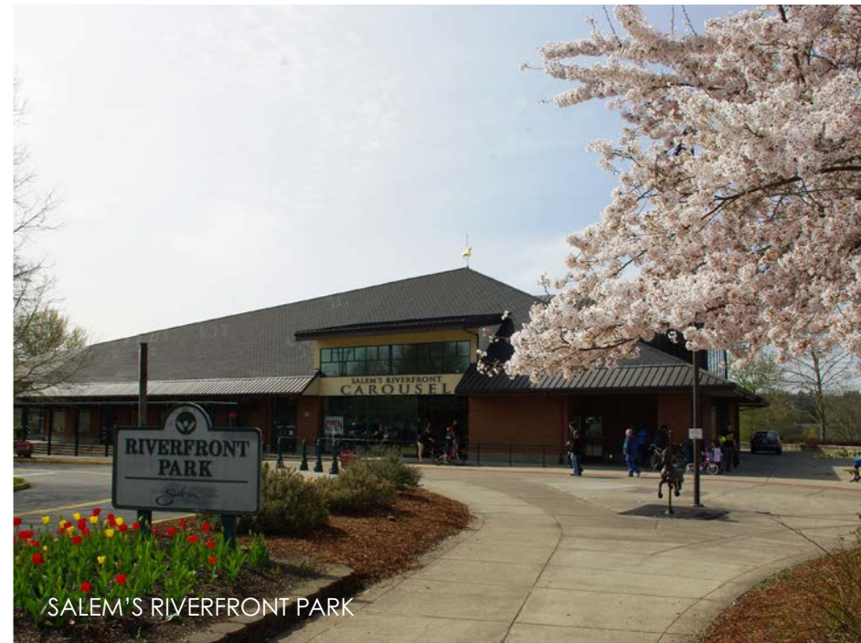
SALEM’S RIVERFRONT PARK

Retail and dining are anchored by centers such as the Willamette Town Center and Keizer Station, which feature national retailers, restaurants, and entertainment venues. Downtown Salem continues to thrive with a mix of independent shops, cafés, breweries, and farm-to-table restaurants that reflect the area’s agricultural richness.