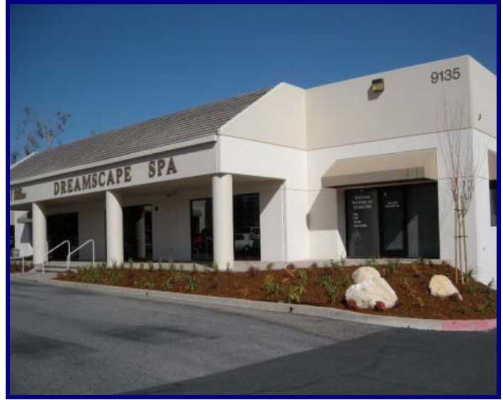
9135 & 9125 Archibald Ave., Rancho Cucamonga, CA