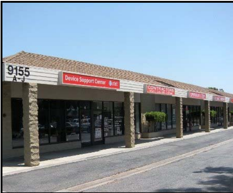
9155 Archibald Ave., Rancho Cucamonga, CA