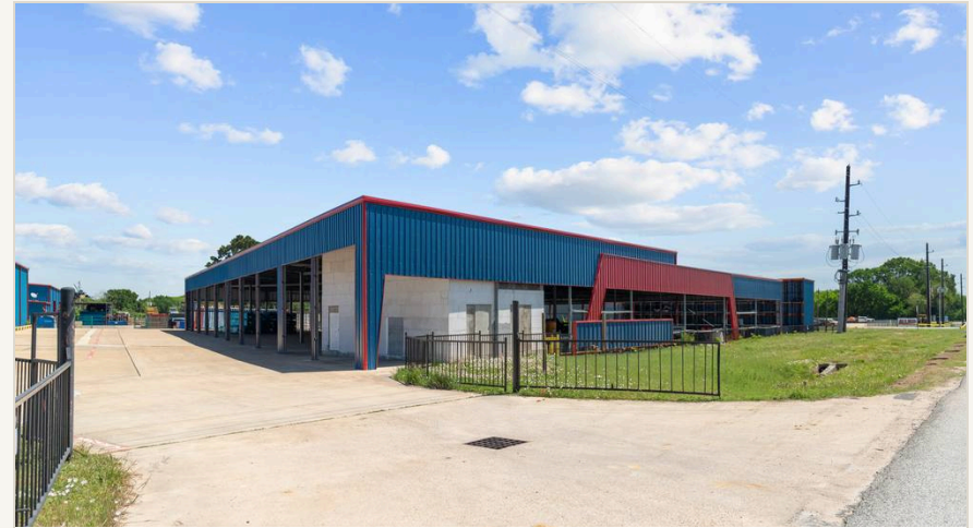
BUILDING 2 – PARCEL 02