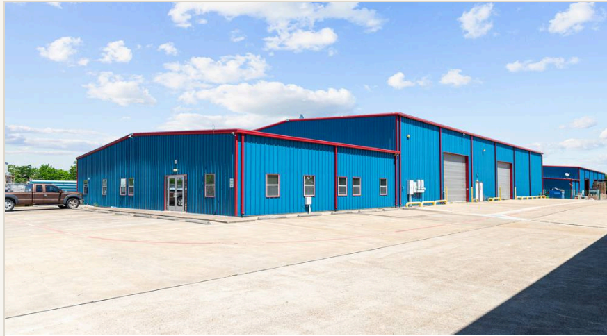
BUILDING 1 – PARCEL 01