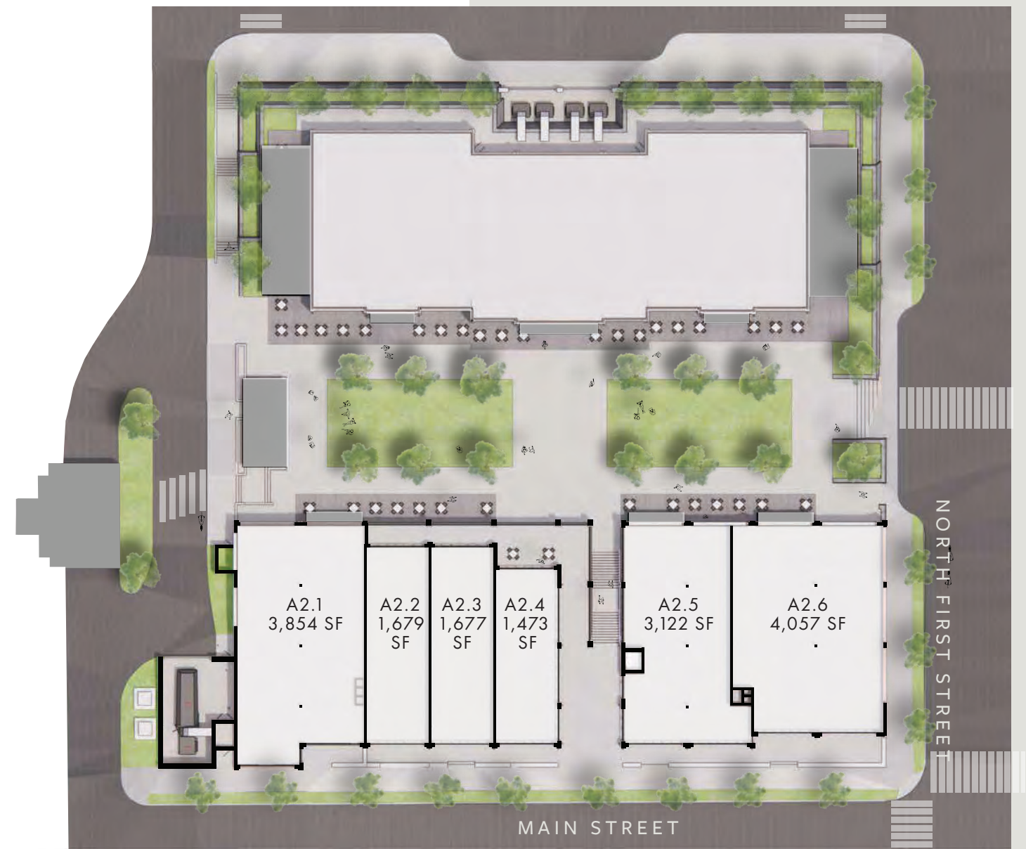
MAIN ST. LEVEL