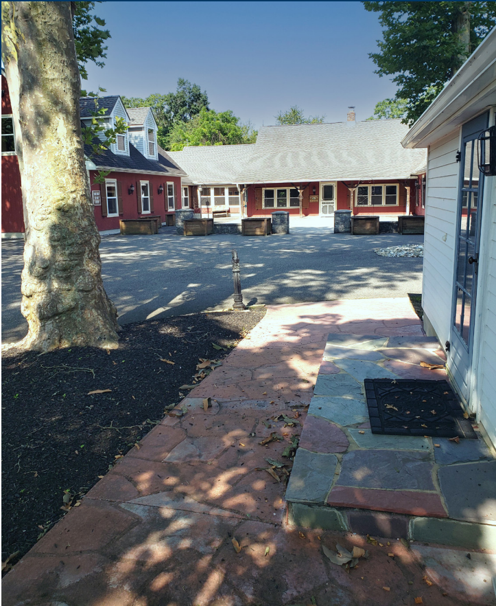
1st Parcel Main office building