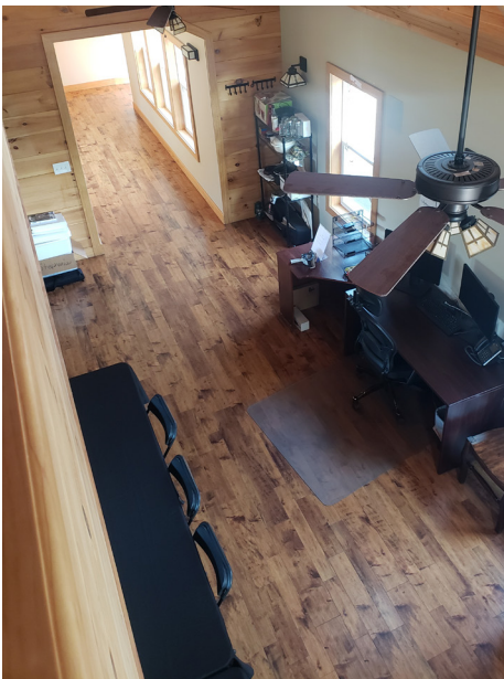
1st Parcel Main office building interior