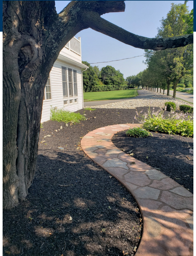
1st Parcel "White House" Auxiliary office building