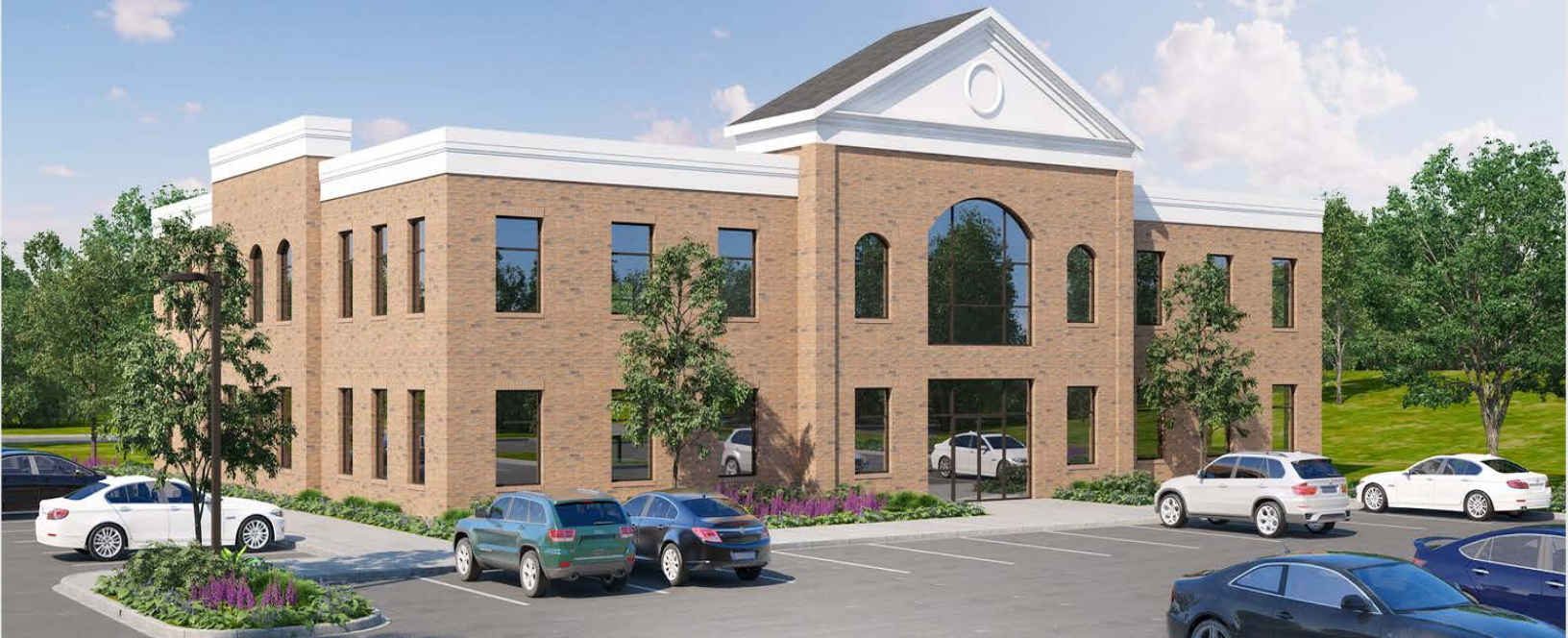
Conceptual Office Building Rendering