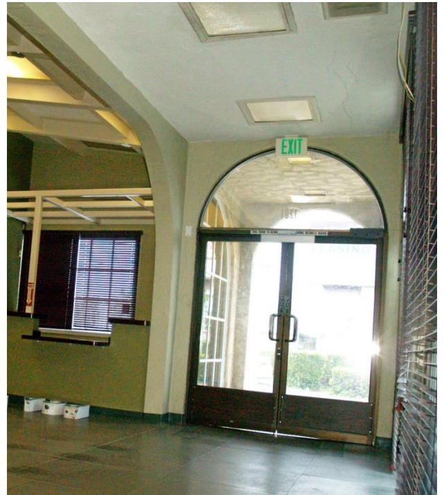
1201 E. 17 TH STREET ENTRY DOOR

This information has been secured from sources we believe to be reliable, but we make no representations or warranties, expressed or implied, as to the accuracy of the information. References to square footage or age are approximate. Buyer must verify the information and bears all risk for any inaccuracies.