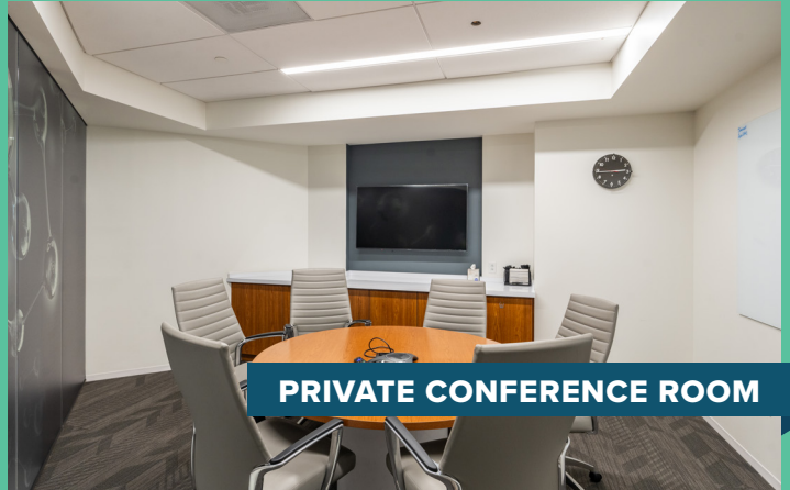
PRIVATE CONFERENCE ROOM