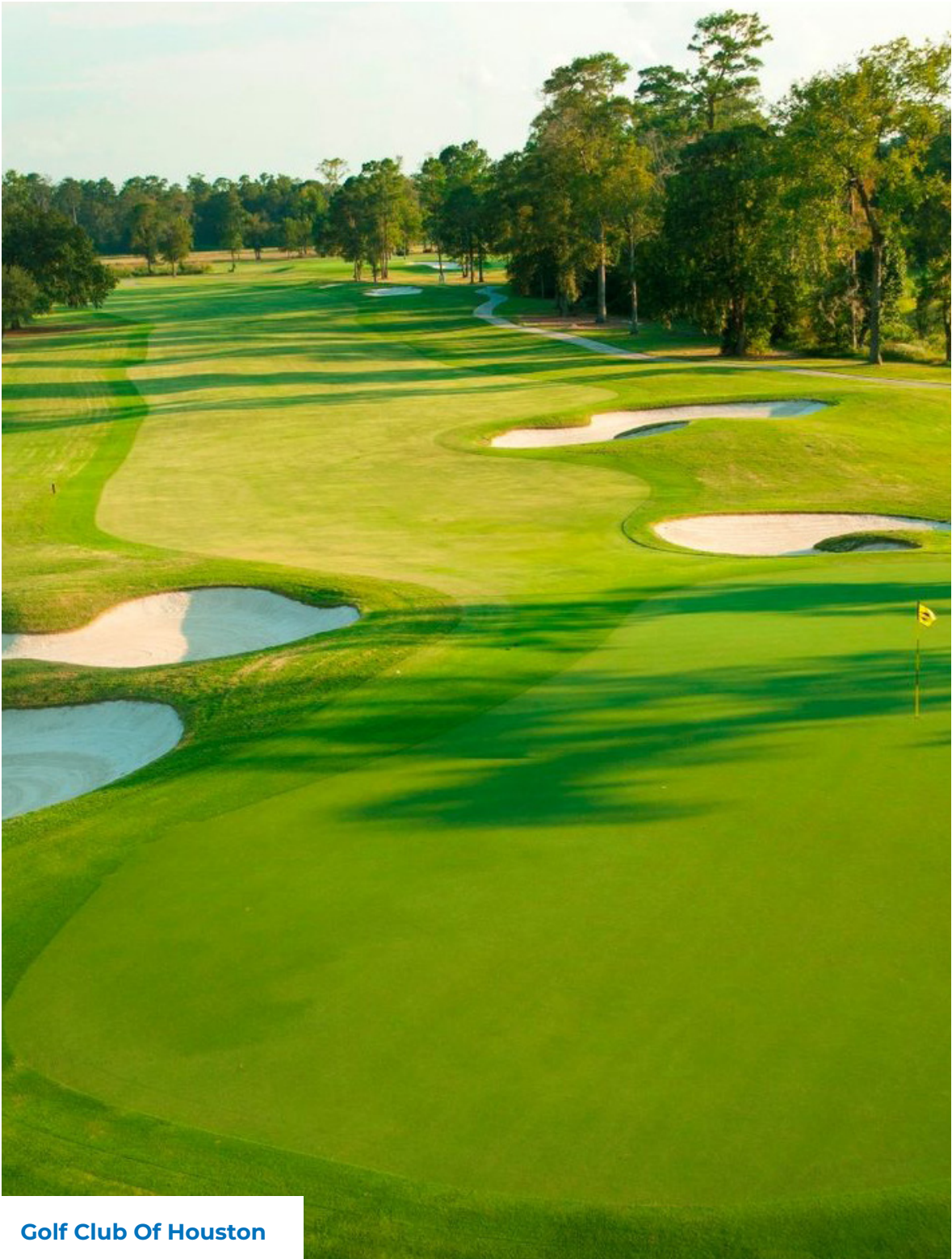
Golf Club Of Houston

Park Lakes Medical Professional Building is in Humble, located about 20 minutes northeast of downtown Houston. With its excellent parks, recreational facilities, and proximity to Lake Houston, Humble offers a relaxed lifestyle surrounded by natural beauty. Whether you're enjoying a concert at the Charles Bender Performing Arts Center or shopping at Deerbrook Mall, there's a strong sense of connection and hometown spirit that defines life in Humble.