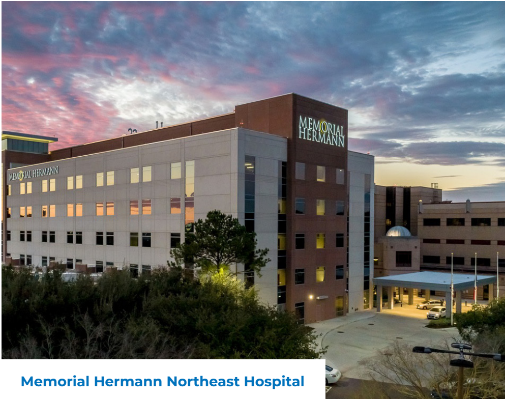
Memorial Hermann Northeast Hospital