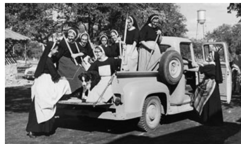
The Benedictine Sisters in Boerne