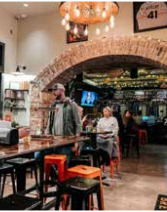
Free Roam Brewery

Explore shops, restaurants and vibrant local amenities