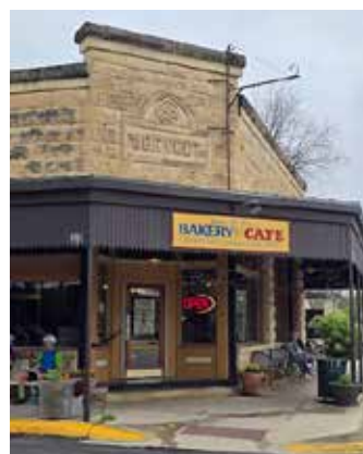
Bear Moon Bakery