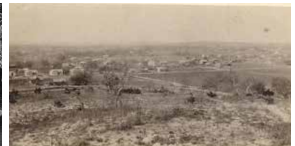
Original site from 1918