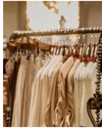
Ella Blue Boutique