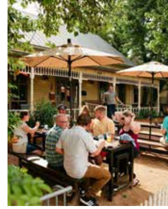
Cibola Creek Brewery