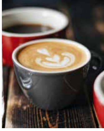
Black Rifle Coffee