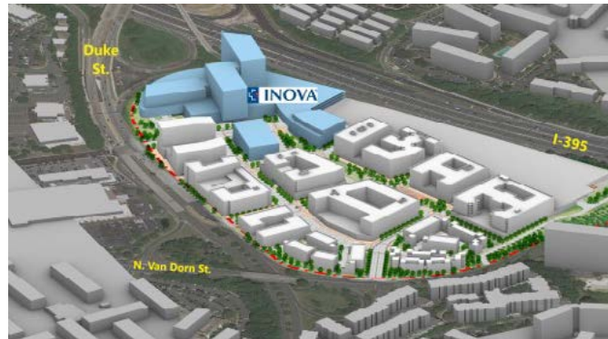
(Concept drawing, subject to change)