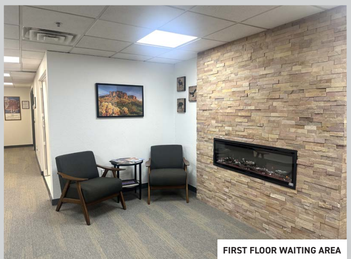
FIRST FLOOR WAITING AREA