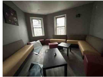
2nd Floor Living Room/Office