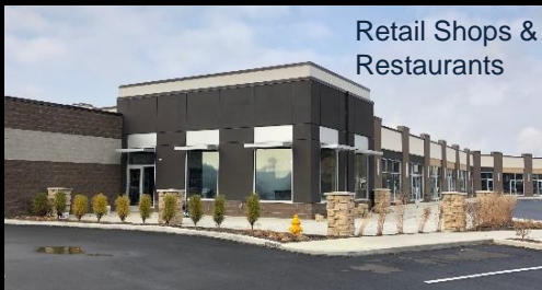
Retail Shops & Restaurants