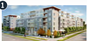
HQ DWELL 13963 105A Avenue