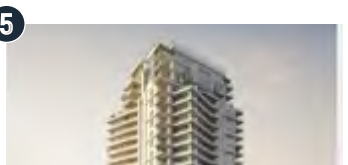
VIVERE BY SOLTERRA 15200 Guildford Drive