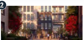
GUILDHOUSE 14968 101a Avenue