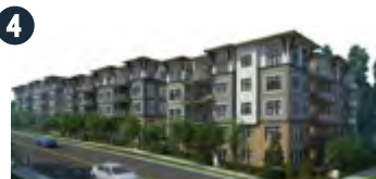
G3 RESIDENCES 15388 105th Avenue