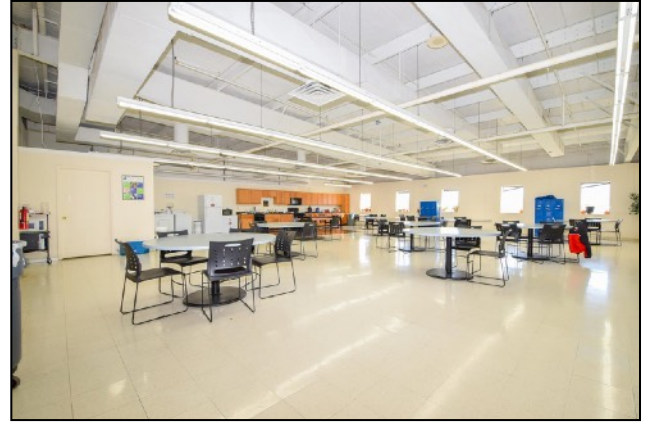
Employee Break Room