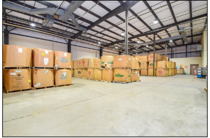
Fully Conditioned Space