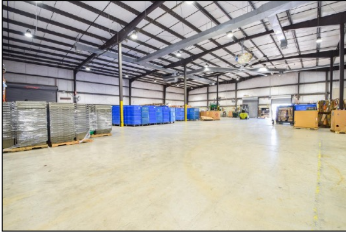
24,000 SF Tall Ceiling Warehouse