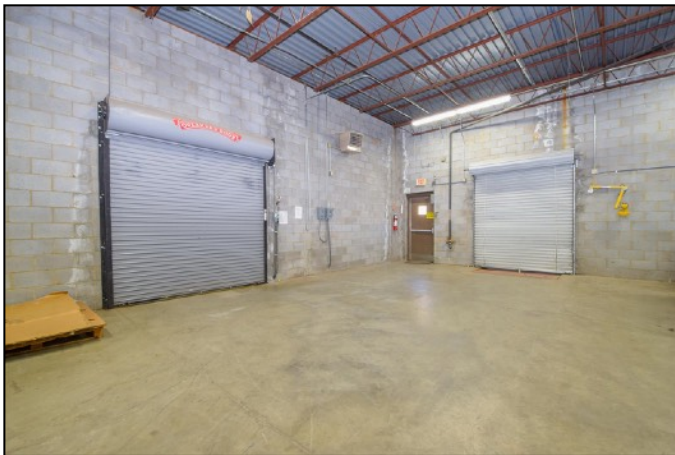
2 Rear Dock Doors