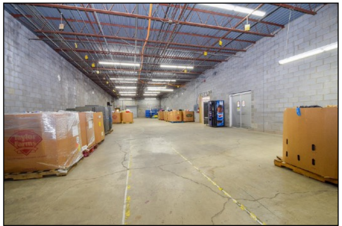
Additional Rear Warehouse Area