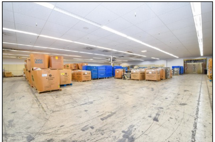
16,000 SF Production | Storage