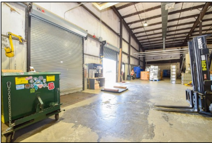
2 Front Dock Doors with Levelers + 1 Drive-In Door