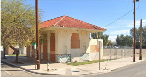
138 South 8 th Street Brawley, California 92227