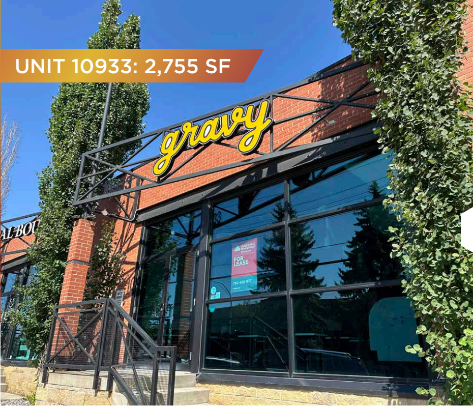
UNIT 10933: 2,755 SF