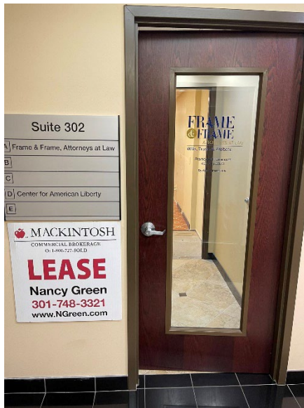
Exit Door from Suite To Common Hallway

The Suite contains an Entrance Room that can be a Receptionist Area / Conference Room and Six Offices.