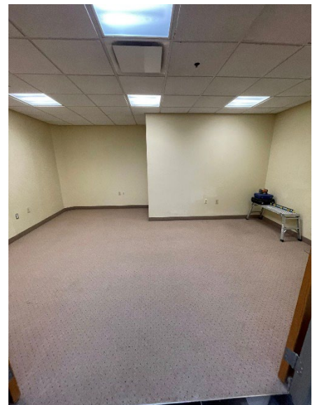
Large Office 3

All information deemed reliable, but not guaranteed