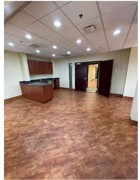
Large Open Office 1