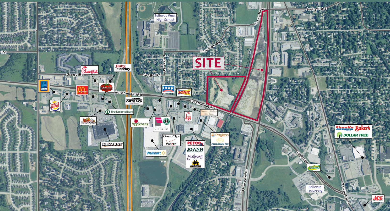
Cornhusker & Fort Crook, Bellevue, NE