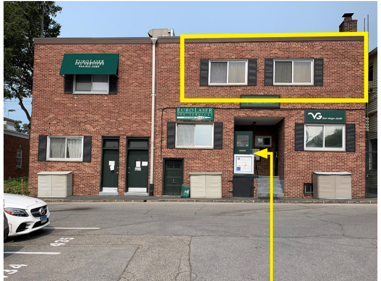
ADDITIONAL ENTRANCE FROM PARKING LOT