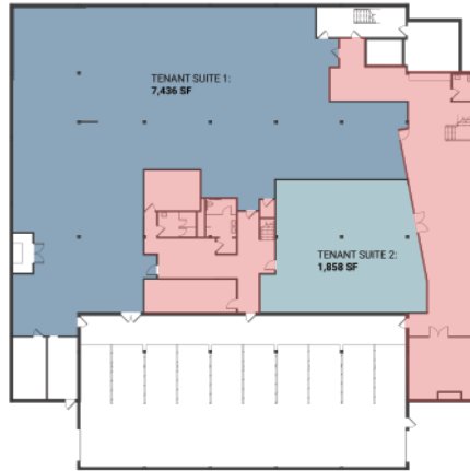
LOWER LEVEL - DOUBLE SUITE

DUAL TENANT: UNIT 1: 7,436 SQUARE FEET UNIT 2: 1,858 SQUARE FEET