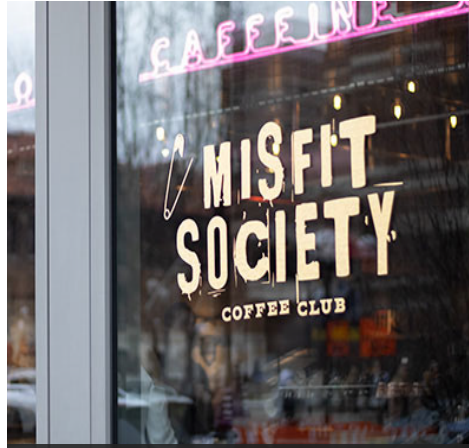
Misfit Society Coffee Club