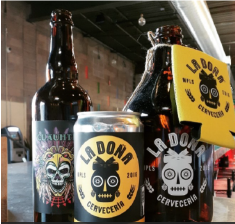
La Dona Cerveceria