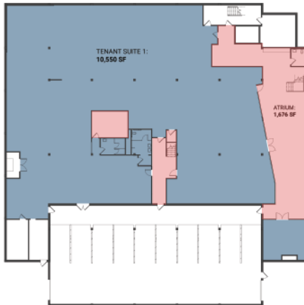
LOWER LEVEL - SINGLE SUITE

SINGLE TENANT: UNIT 1: 10,550 SQUARE FEET