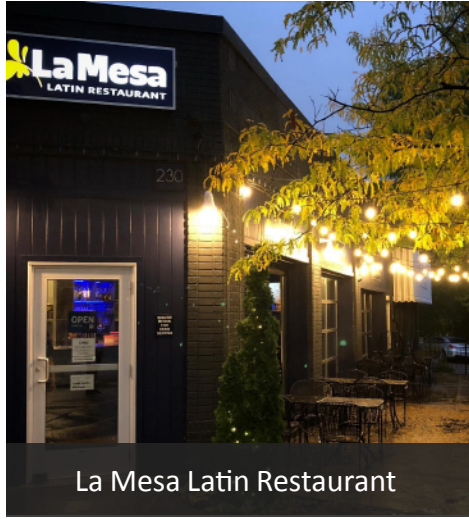
La Mesa Latin Restaurant