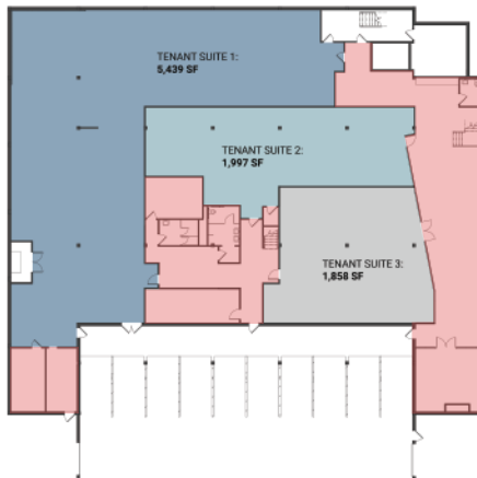
LOWER LEVEL - TRIPLE SUITE

THREE TENANTS: UNIT 1: 5,439 SQUARE FEET UNIT 2: 1,997 SQUARE FEET UNIT 3: 1,858 SQUARE FEET