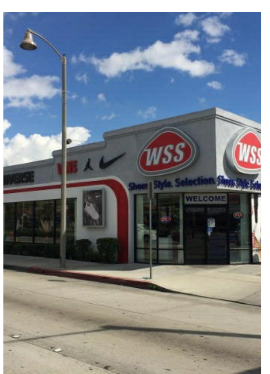
6250 Atlantic Ave 6250 Atlantic Ave, Bell, CA 90201