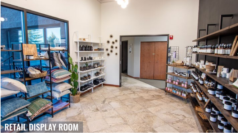
RETAIL DISPLAY ROOM