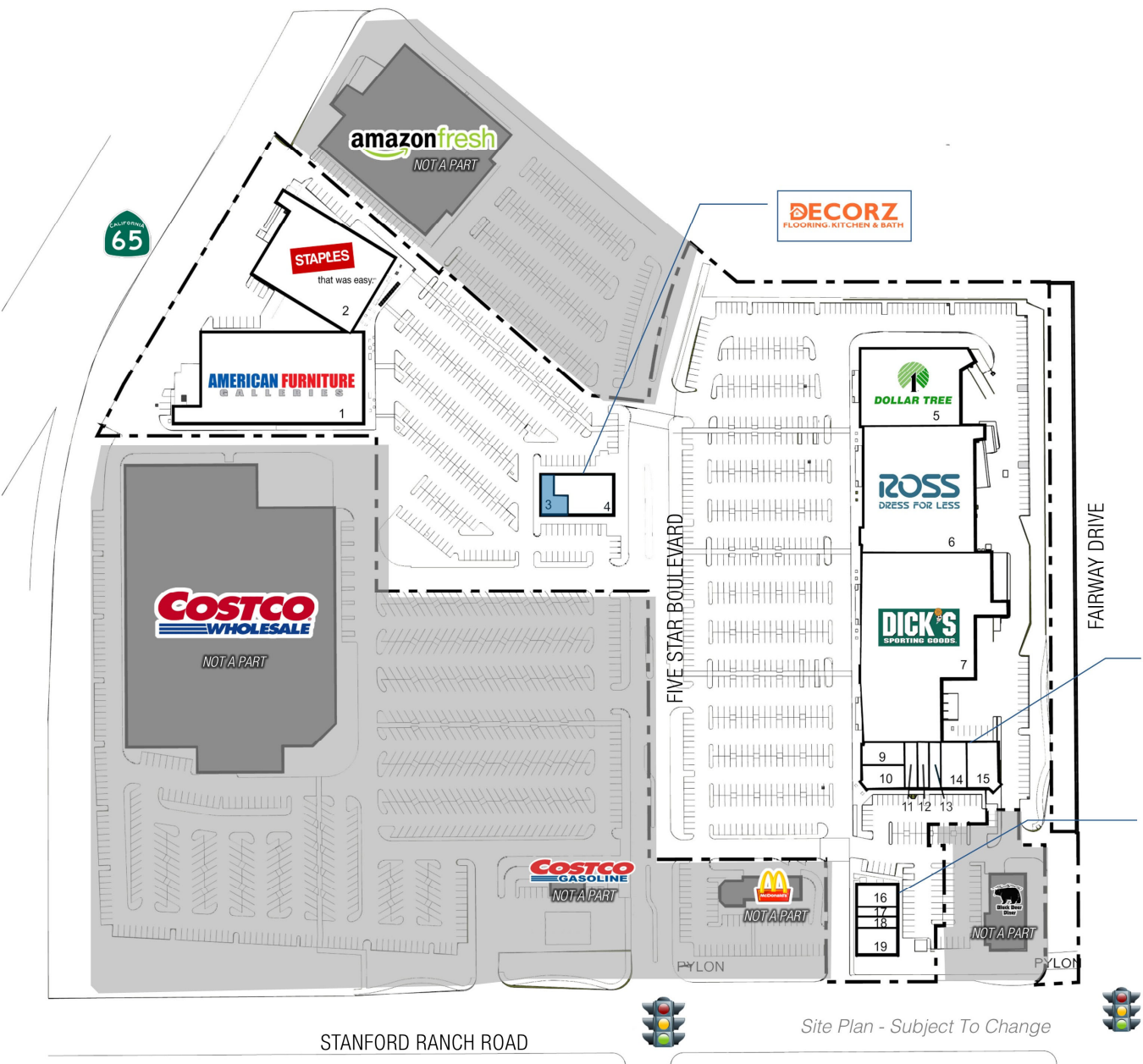
Site Plan - Subject To Change