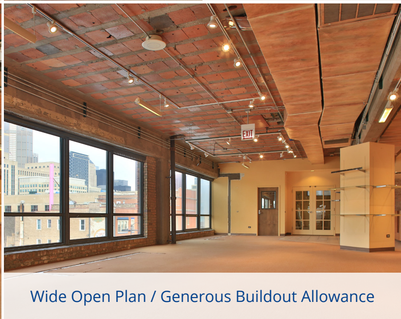
Wide Open Plan / Generous Buildout Allowance