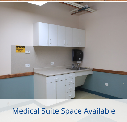
Medical Suite Space Available