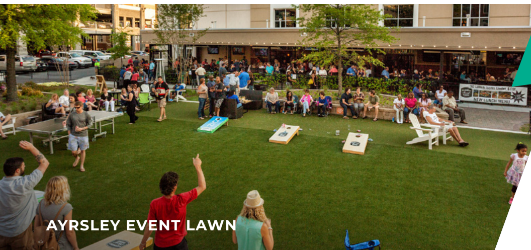
AYRSLEY EVENT LAWN