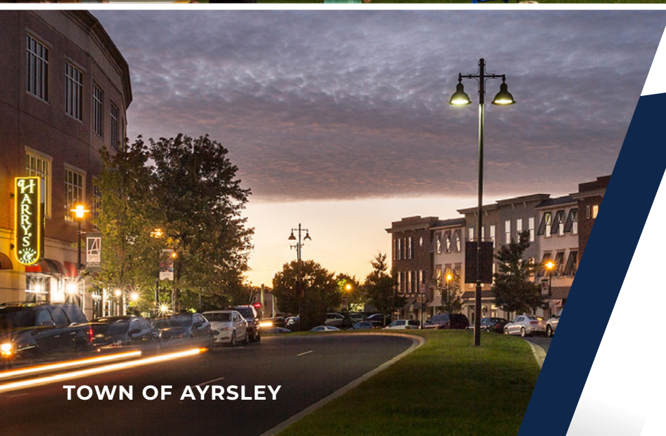
TOWN OF AYRSLEY